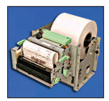
Looping Presenter with Document Presenter