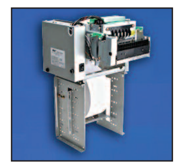
Optional 10" Diameter Paper Roll Holder