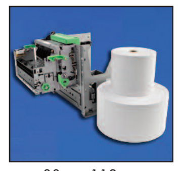
80mm-112mm Paper Width