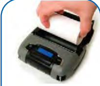
Drop-In & Print